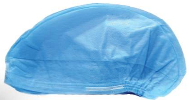
Smilecare Surgeon Cap (100 Pcs per box)