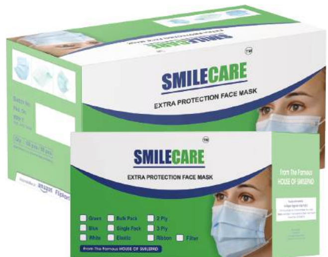
Smilecare Surgical Face Mask (100 Pcs Per Box)