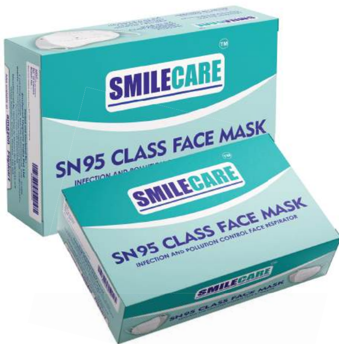
Smilecare SN95 Face Mask (25 Pcs per box)