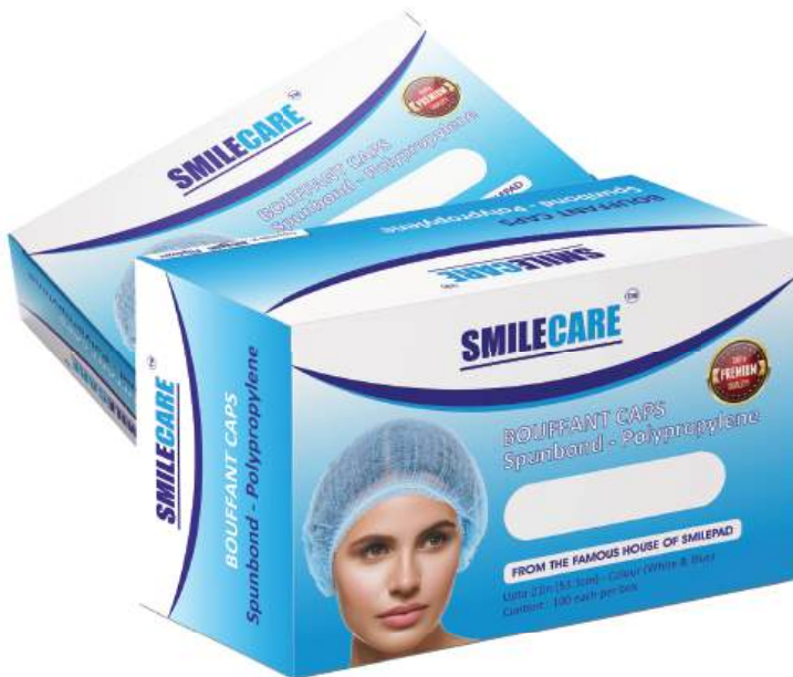
Smilecare Bouffant Cap (100 Pcs per box)